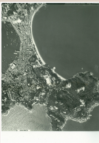
Before construction (1992)

Below are the aerial photos taken in 1992, 1995 and 1997, which shows the stages of development of the Field Studies Centre.