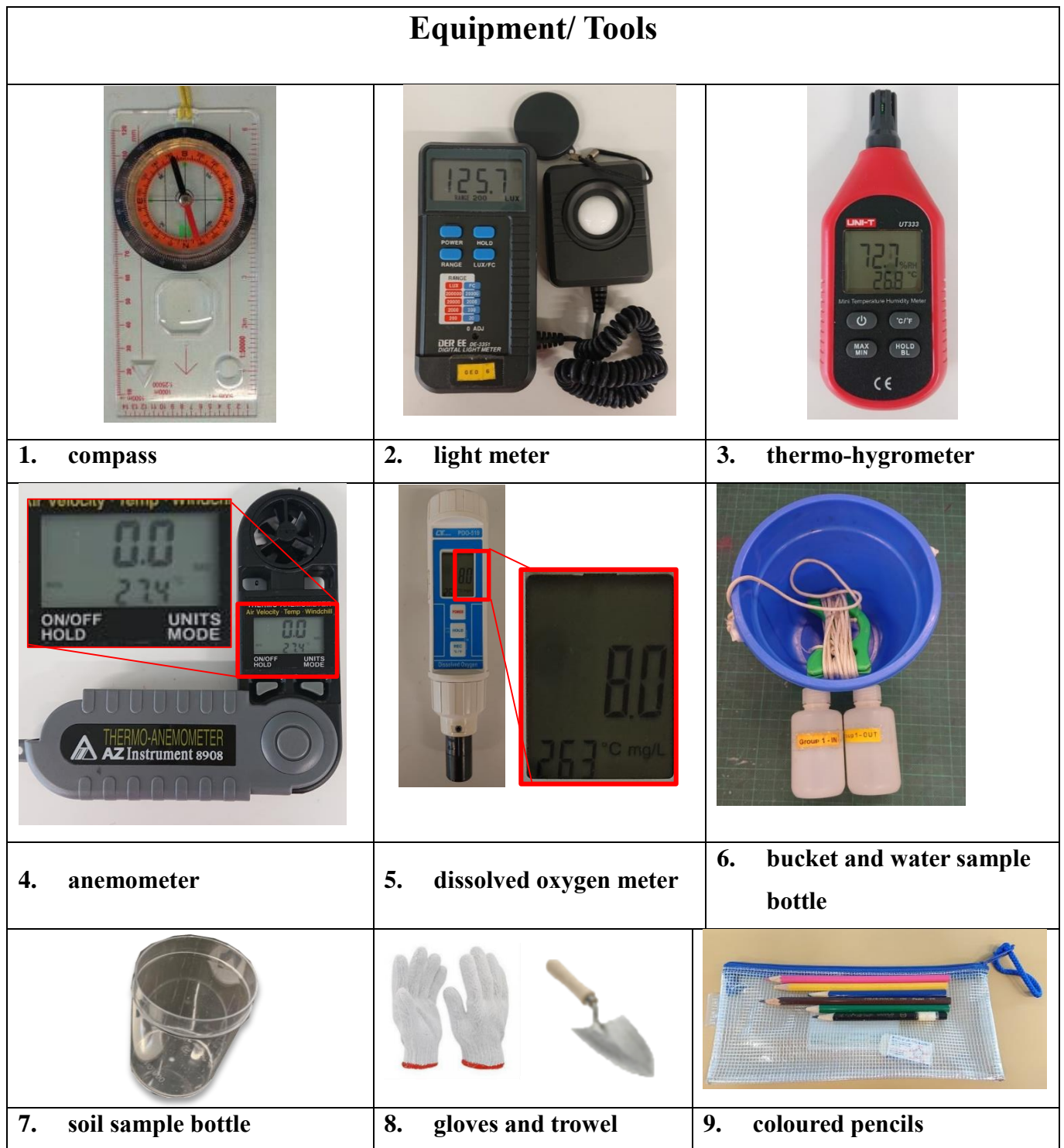
Table 2 Equipment/ tools for fieldwork